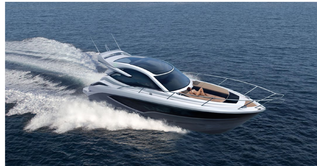
The 355 Hts is a quick and nimble cruiser